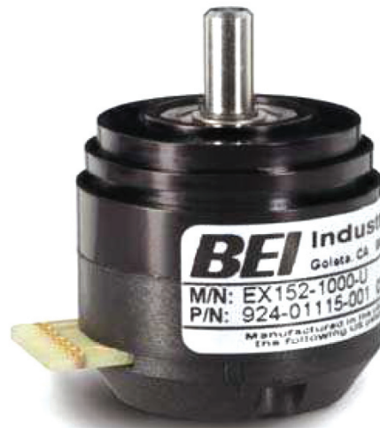
Model BEI EX152