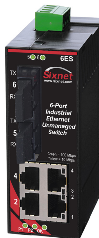
SL-6ES-4/5 Lexan Case Standard Temperature