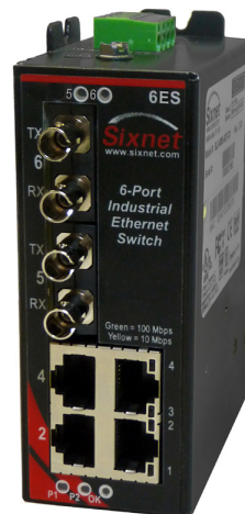
SLX-6ES-4/5 Aluminum Case Wide Temperature

We have been designing industrial hardware such as Remote Terminal Units for over 30+ years and have used this expertise to design the toughest Ethernet switches on the market. Don't trust your critical communications to so-called industrial hardware from commercial switch manufacturers. Sixnet switches give you proven assurance that your system will keep running for years to come.